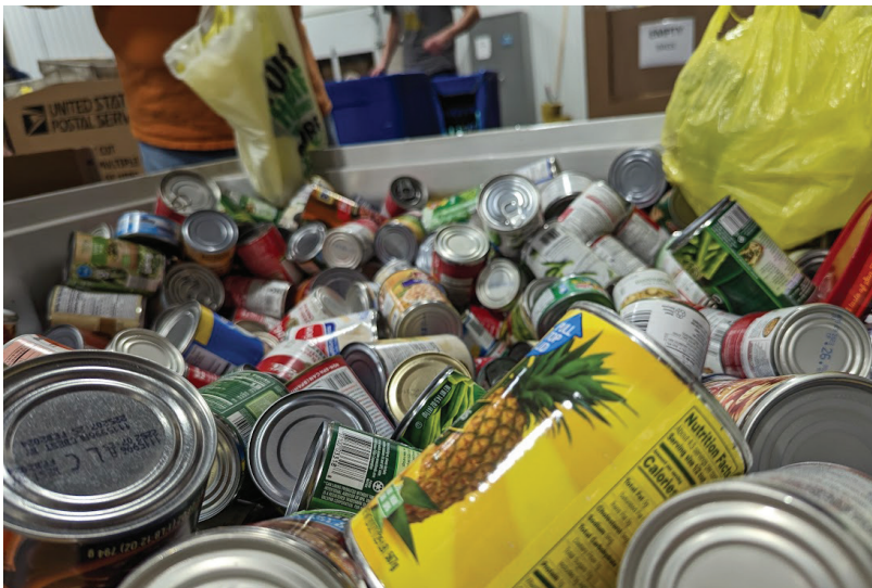
Eau Claire, WI Br. 728

In the 30 years since it began, the food drive has collected approximately 1.9 billion pounds of food for