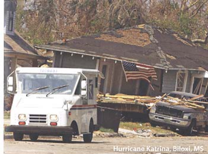
Hurricane Katrina, Biloxi, MS

PERF receives the vast majority of contributions through payroll deductions authorized by postal employees and other federal employees during the annual Combined Federal Campaign. PERF is designated as a National Independent