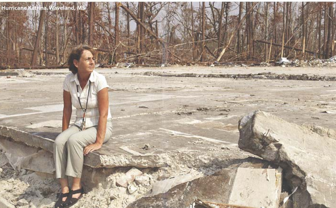
Hurricane Katrina, Waveland, MS

The Postal Employees' Relief Fund is a 501 (C) 3 Charitable Organization. Contributions are tax-deductible.