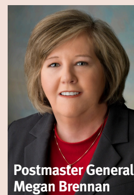
Postmaster General Megan Brennan

On May 18, The Washington Post reported that President Donald Trump had met with Postmaster General Megan Brennan and urged her to increase the cost of parcel shipping for Amazon and similar companies, as much as double the rates they currently pay.