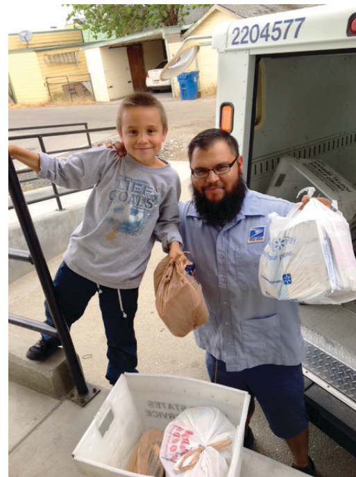
Caldwell, ID Branch 1386