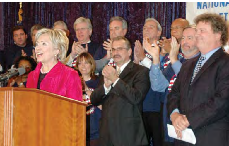
Electing a worker-friendly president is the major political goal of the union in 2008.