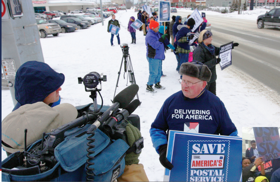
Hundreds of media outlets covered the event, like those in Alaska (l) and Georgia (below). Rallies ranged in size from only a few participants, to some much larger, including this one in Connecticut (bottom).