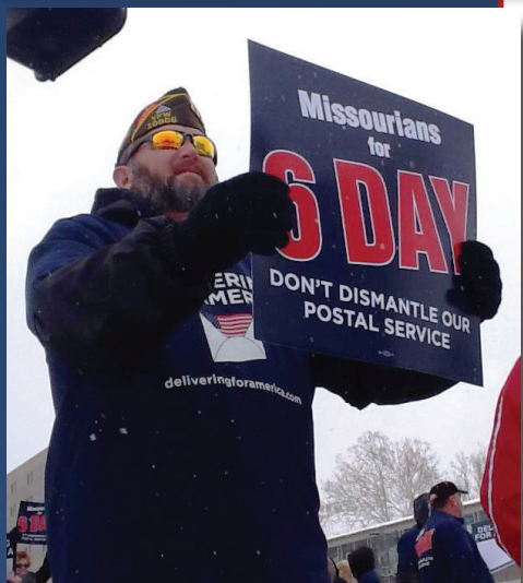
Letter carriers and other activists stood tall in Washington (top), Ohio (center) and Missouri (above).

editor-in-chief Katrina vanden Heuvel noted that “Congress has the power to block the USPS from cutting Saturday service. It should begin there. This is a public service worth saving.”