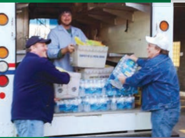
Left and below: Images from the special food drive