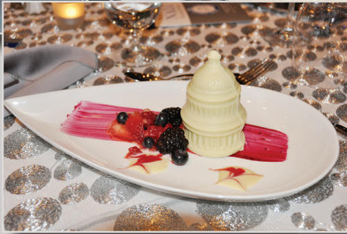
A crowd of several hundred attended the ceremonial dinner, held in Washington, DC.

continued existence of the Postal Service was never in doubt,” he said. “Although the public’s support of the Postal Service has never waned or wavered, we have faced a sustained assault on the Postal Service as we know it from both postal executives and political opponents over the past several years.”