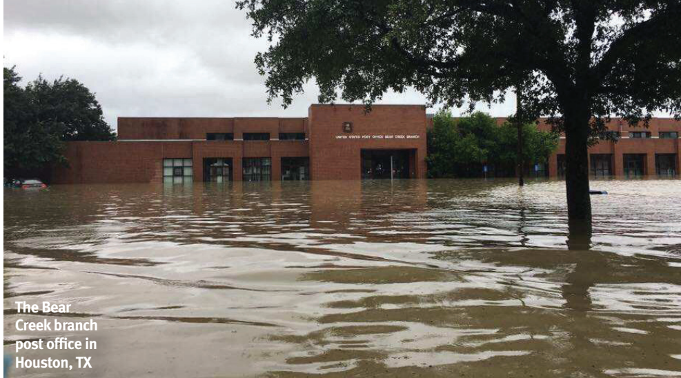
The Bear Creek branch post office in Houston, TX