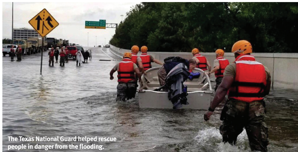
The Texas National Guard helped rescue people in danger from the flooding.