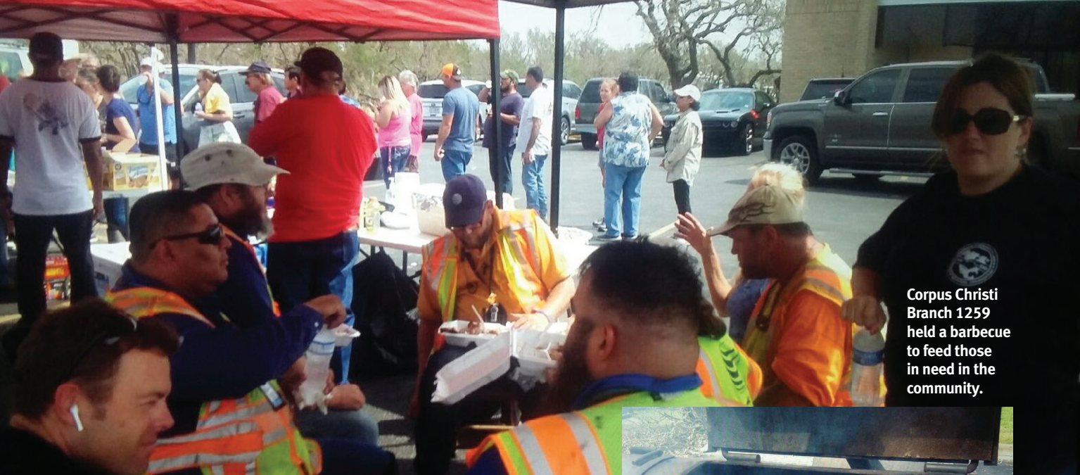
Corpus Christi Branch 1259 held a barbecue to feed those in need in the community.