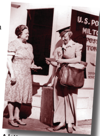
A letter carrier during World War II

After two weeks on the job, both women received high marks for their service, and Postmaster Merritt O. Chance urged them both to take the Civil Service exam and apply for jobs as city carriers. He also declared that women would thereafter be eligible for the job. Over the remaining 11 months of the war, the Post Office Department hired dozens of women in several cities across the country, typically when no men were available.