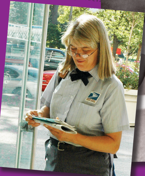
Postal uniforms have evolved since women delivered during World War I (above).