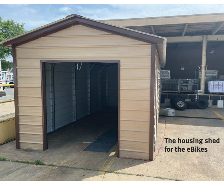
The housing shed for the eBikes