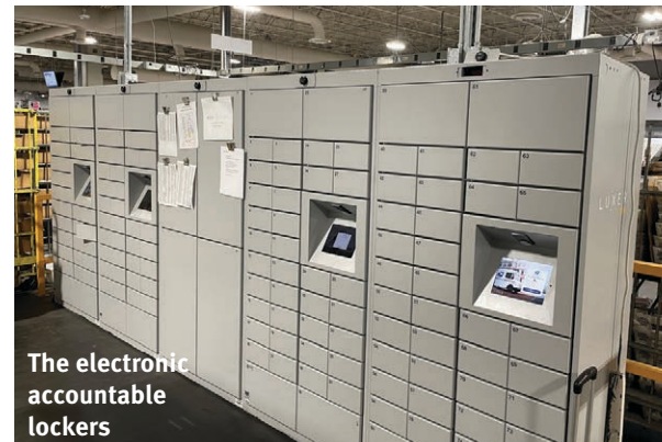
The electronic accountable lockers

The Postal Service introduced this pilot program in early October 2022 hoping to improve record-keeping and increase security of the accountable process. USPS installed a total of five