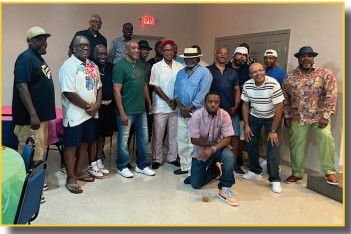
Birmingham, AL Branch 530 held a "sundresses and cigars" dance

events, including swimming, arts and crafts, sports and games. Letter carriers not only help fund these camps some carriers volunteer their time to work directly with the children.