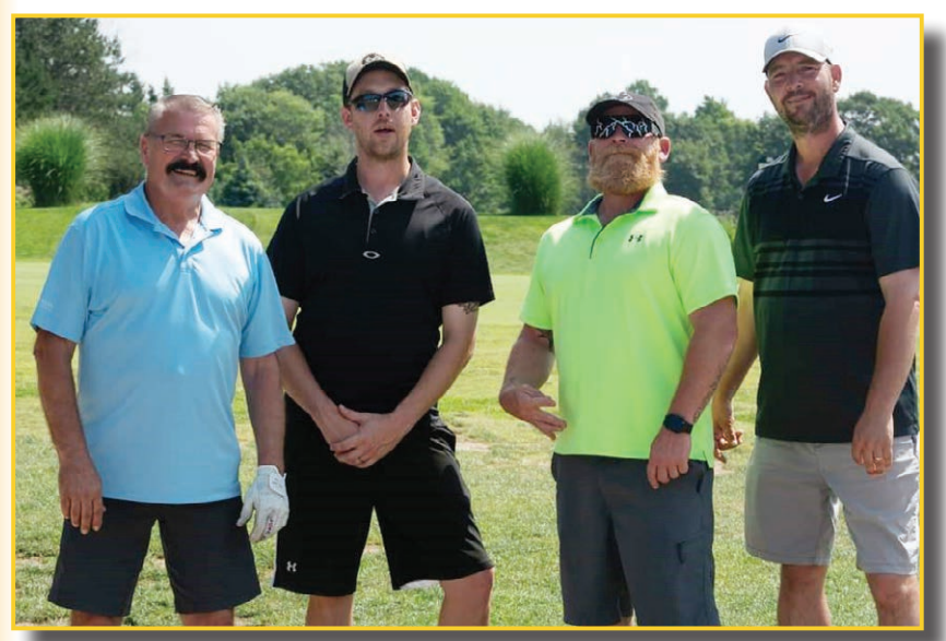
Erie, PA Branch 284's golf tournament

added, "and look forward to meeting some of you in person."