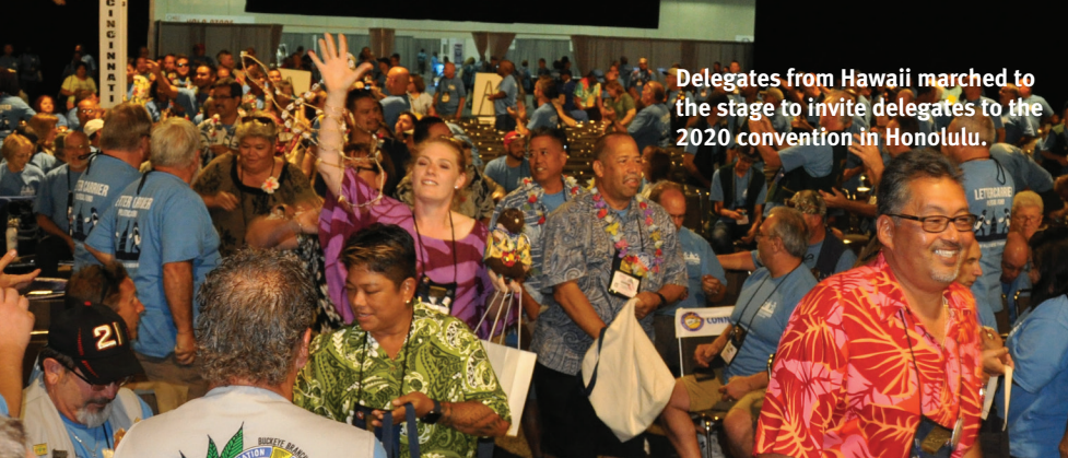
Delegates from Hawaii marched to the stage to invite delegates to the 2020 convention in Honolulu.

top collections of food in last May's Letter Carriers' Food Drive: