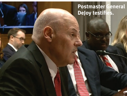
Postmaster General DeJoy testifies.

In their questioning, Chairman Gary Peters (D-MI), Sen. James Lankford (R-OK) and Ranking Member Paul all stated that the Postal Service needed a new investment strategy for its retirement funds instead of keeping them in low-yield Treasury bonds. NALC has had productive conversations on Capitol Hill with lawmakers about an updated, responsible, more-profitable investment strategy for these funds.