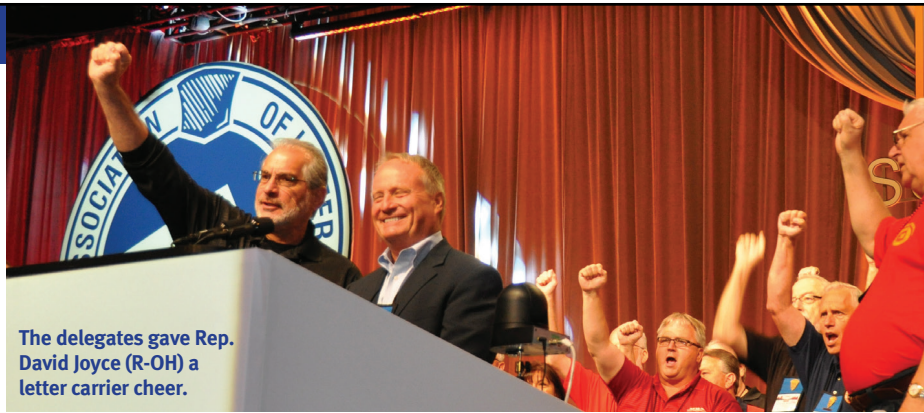
The delegates gave Rep. David Joyce (R-OH) a letter carrier cheer.