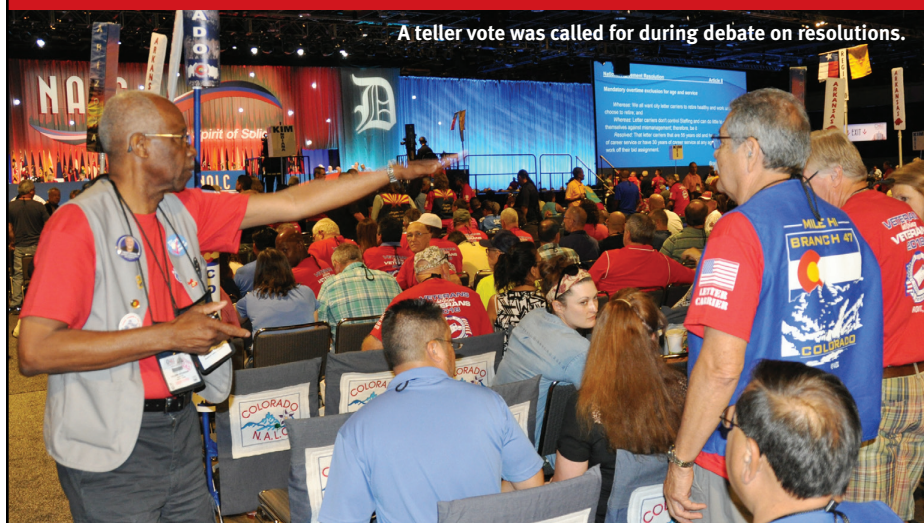
A teller vote was called for during debate on resolutions.

military veterans in the room to stand and be recognized in their red veteran T-shirts. He thanked them for their service and said he was confident that there would be enough volunteers Tuesday afternoon to pack 2,000