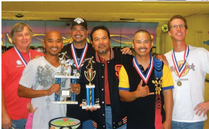
Above right: NALC members, friends and families came out for Fort Wayne, IN Branch 116's bowlathon. Above: The award winners from Hayward, CA Branch 1707 Right: Perfect form for a St. Louis Branch 343 bowler.