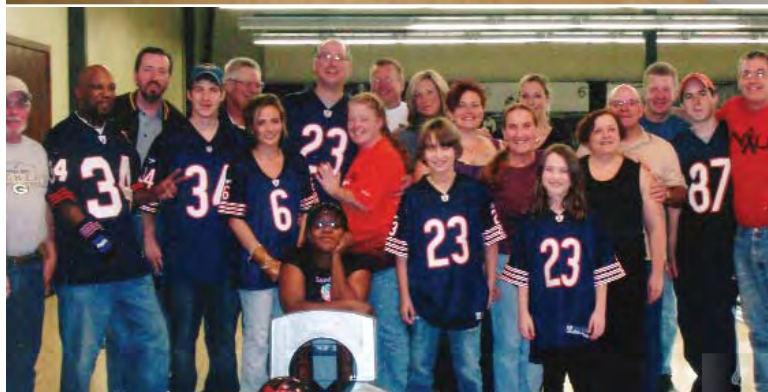
Opposite page: South Florida Branch 1071 and Ft. Lauderdale Branch 2550 joined up for the bowlathon. Pictured is one of the many members' children who participated.