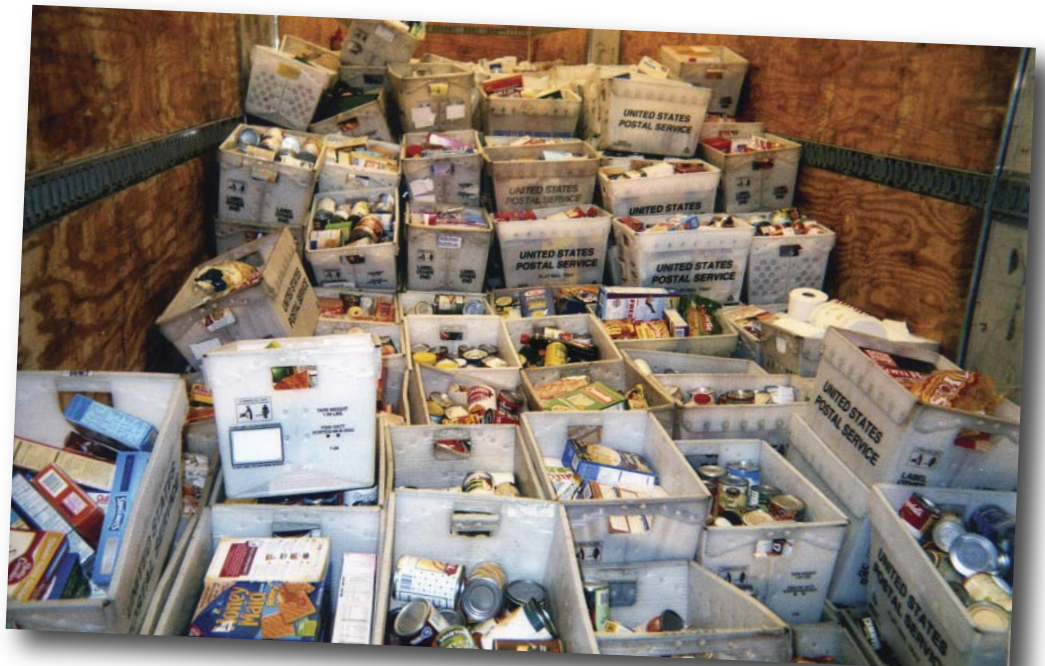
Right: A truck full of food for Branch 522, Bloomington, Illinois.