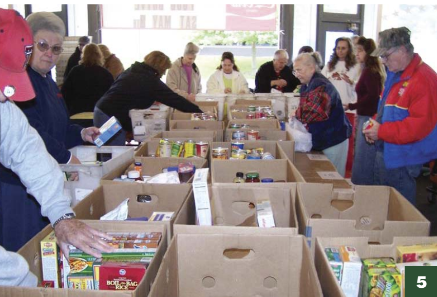
10: A lot of smiles for Branch 608, Oak Park, Illinois.