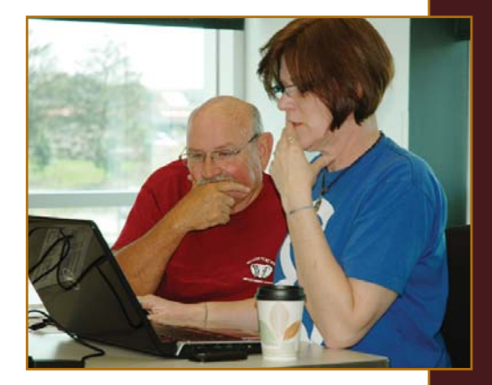
Carriers from around the country helped put together the training on the new JARAP.

The intent of the parties at the national level in making an agreement