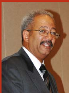
Rep. Chaka Fattah (D-PA)