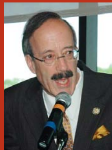
Rep. Eliot Engel (D-NY)