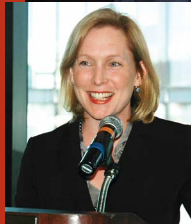
Sen. Kirsten Gillibrand (D-NY)