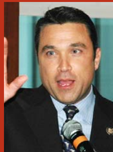
Rep. Michael Grimm (R-NY)