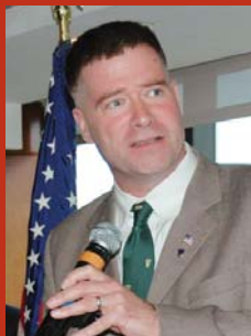
Rep. Chris Gibson (R-NY)