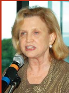
Rep. Carolyn Maloney (D-NY)