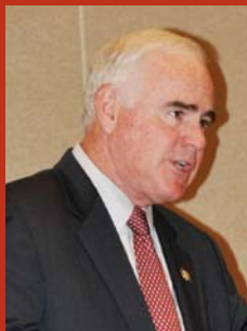
Left: Rep. Patrick Meehan (R-PA)