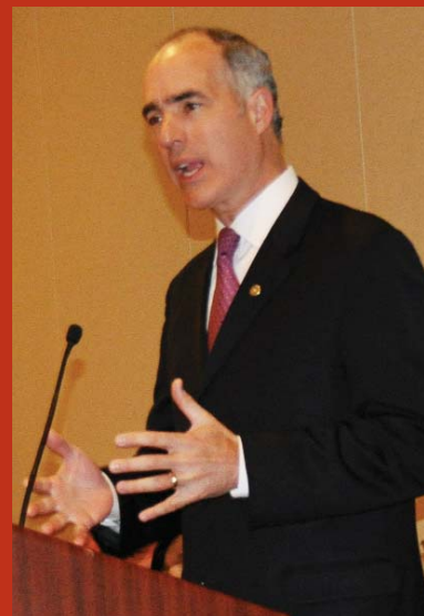
Sen. Bob Casey (D-PA)