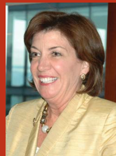
Rep. Kathy Hochul (D-NY)