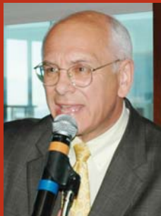
Rep. Paul Tonko (D-NY)