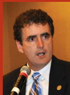
Rep. Michael Fitzpatrick (R-PA)