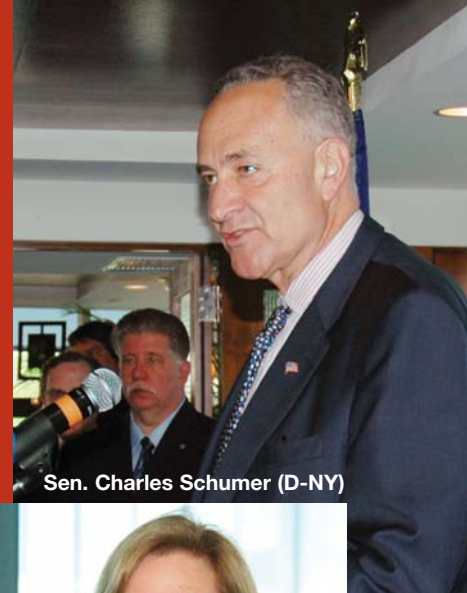
Sen. Charles Schumer (D-NY)