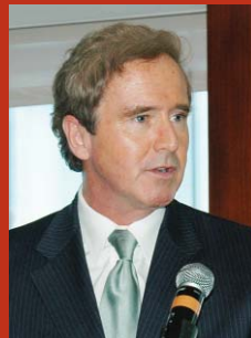
Rep. Brian Higgins (D-NY)