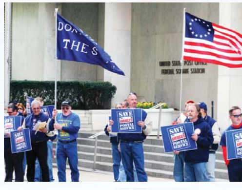
Top: The rally in Newark, NJ

Above: Reading, PA Branch 248 members waved flags, including one that said, "Don't give up the ship."