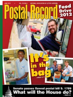
Senate passes flawed postal bill S. 1789 What will the House do?

In the list of food drive totals printed in the August Postal Record , St. Cloud, MN Branch 388's total should have been listed as 102,676 lbs.