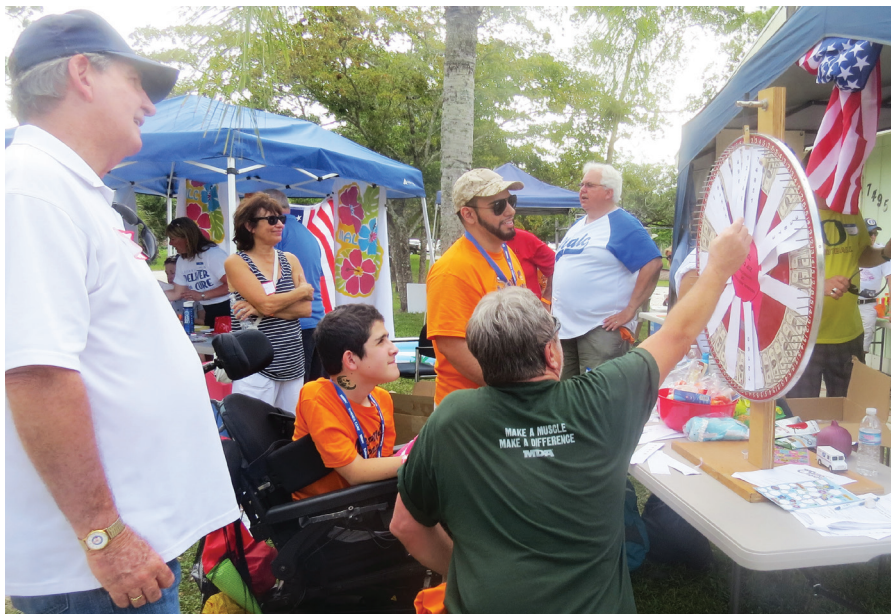
NALC branch representatives had the opportunity to play games with the kids at the camp.