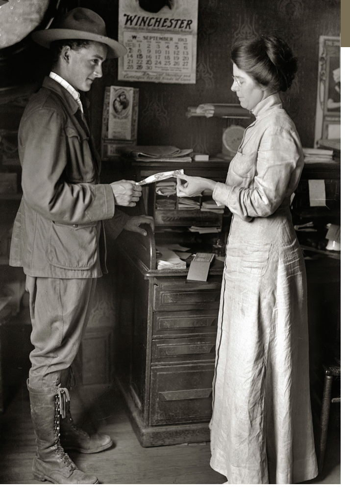
An ad in the November 1913 edition of Boy's Life for the Postal Savings System

A poster advertising the security of the USPSS