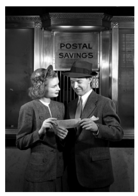
Depositors in 1946

Whether postal banking will ever exist in the future of the United States isn't knowable right now, but it's important that its past not be forgotten. PR