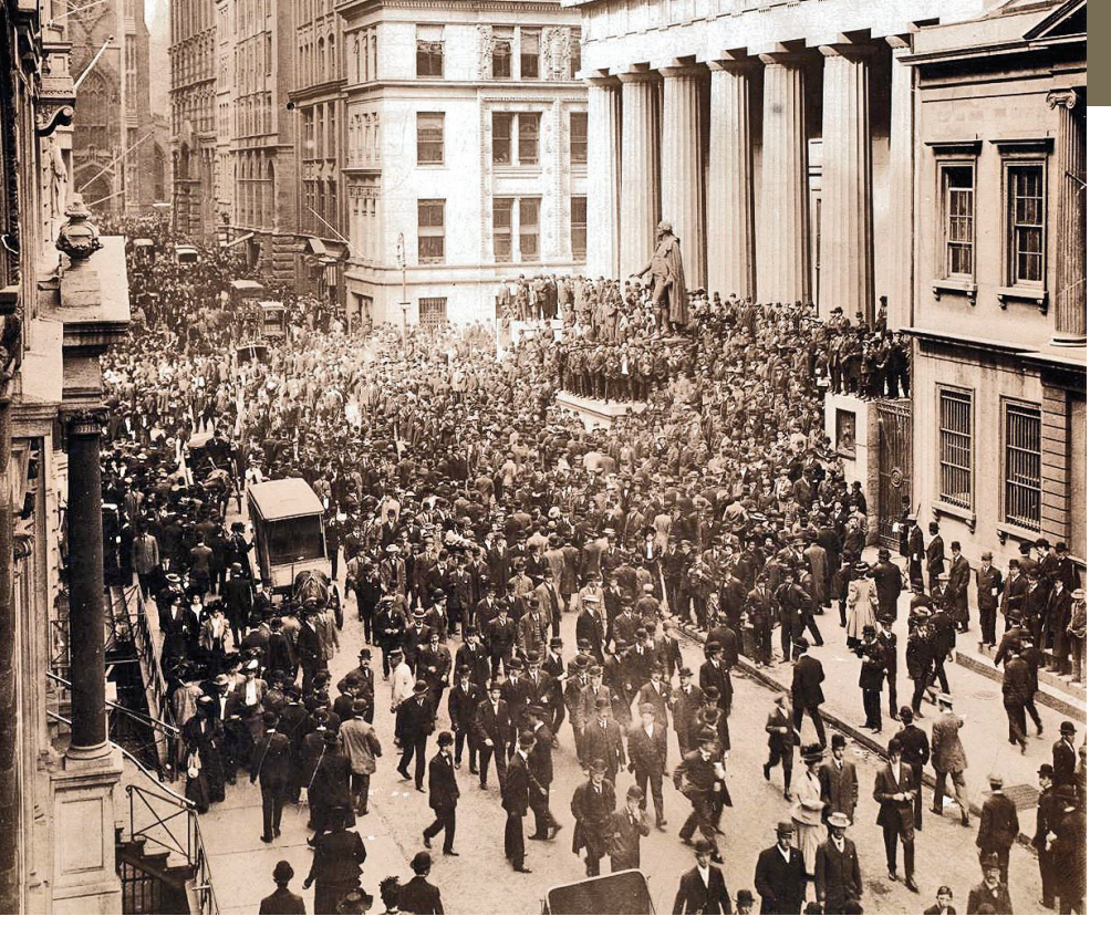
The Panic of 1907