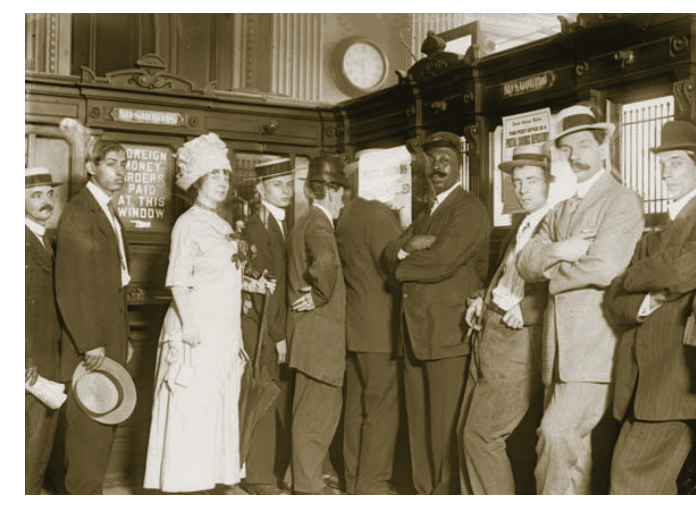
Opposite page: Boy Scouts participate in the Postal Savings System in 1913. Above: The first day at the postal bank in New York

Congress refused to act on Grant's request or that of any subsequent president for the next 40 years, even as 72 bills were proposed.