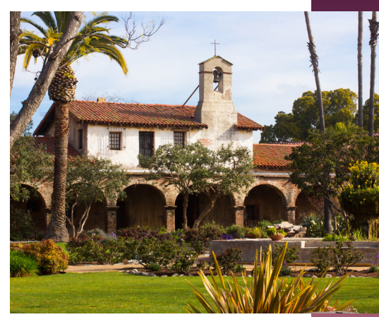
Mission San Juan Capistrano