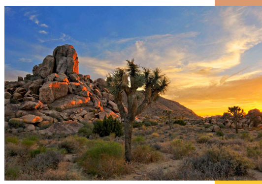
Joshua Tree National Park