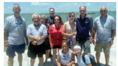
NALC MDA fundraising category winners spent time in Texas visiting an MDA Summer Camp and enjoying some camaraderie.