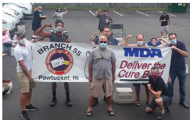
New York, NY Branch 36 members (left) and Pawtucket, RI Branch 55 members (above) were both recognized for their efforts to raise money for MDA in 2020. To see more about branches' MDA fundraising efforts, check out facebook.com/DelivertheCure .