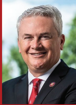
Rep. James Comer (R-KY)