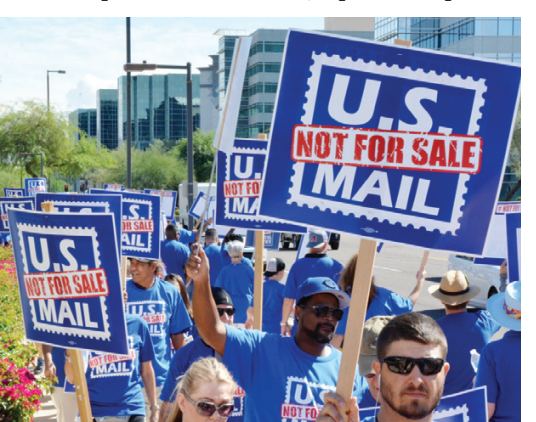
Letter carriers and other postal employees (above and above r) told the White House that the Postal Service should not be privatized in nationwide informational picketing on Oct. 8, 2018.

In 2013, new letter carriers were required to contribute 3.1 percent (up from