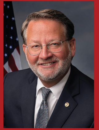
Sen. Gary Peters (D-MI)