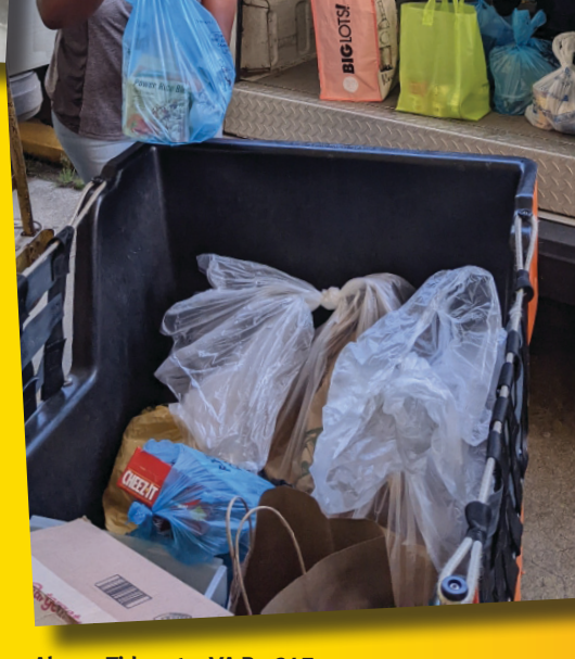
Above: Tidewater VA Br. 247 Left: Hot Springs, AR Br. 543

Carriers in Hawkins County, TN, collected 4,972 pounds of food, the local