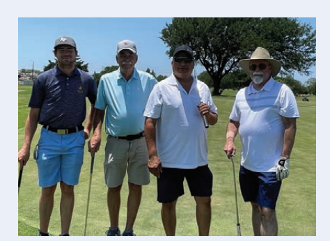
Waco, TX Br. 404 raised $600 for MDA in its fourth annual golf tournament.

Branch presidents or their designated scribes may submit Branch Items to The Postal Record by mail at 100 Indiana Ave. NW, Washington, DC 20001-2144; email at postalrecord@nalc.org; or fax at 202-737-1540. The deadline is the 10th of the preceding month, or if it falls on a weekend or holiday, 9 a.m. E.T. the first business day after. For the August issue, the deadline is 9 a.m. Monday, July 11. The NALC Constitution limits items to 300 words. Photos should be in color; photos sent by email should be at least 150 dpi resolution. Please identify every person in the photo. The Postal Record reserves the right not to print every photo received. Hard-copy photos will not be returned.