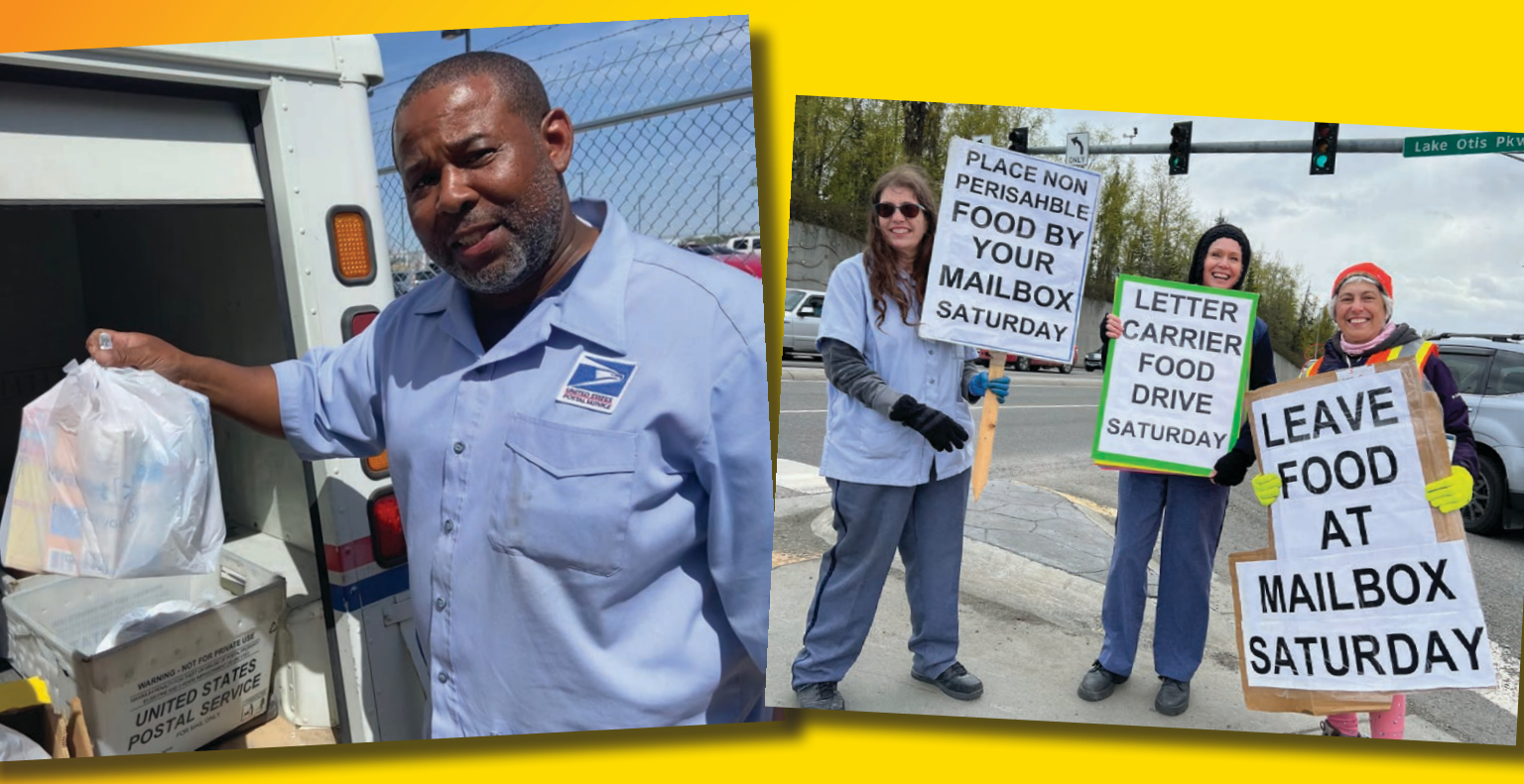
Above: Colorado Springs, CO Br. 204 Right: Anchorage, AK Br. 4319 Below: Kendallville, IN Br. 952