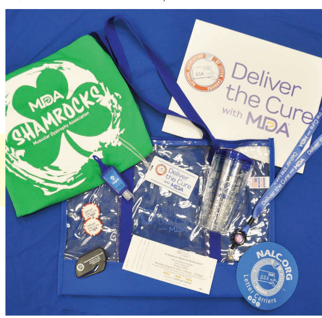
Items in the MDA goodie bag, available with the purchase of a ticket to the A Hawaiian Night to Remember event at the national convention in Chicago in August.

Remember to send me copies of all items sent to MDA so that I can properly give the branch correct credit for the 2022 calendar year.