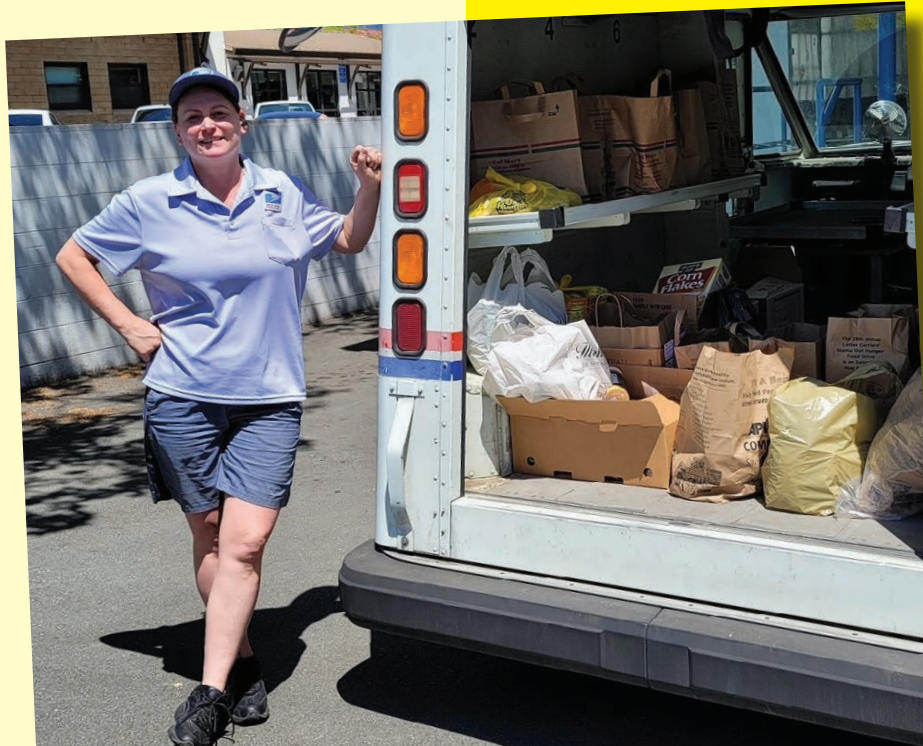
Below: Santa Rosa, CA Br. 183