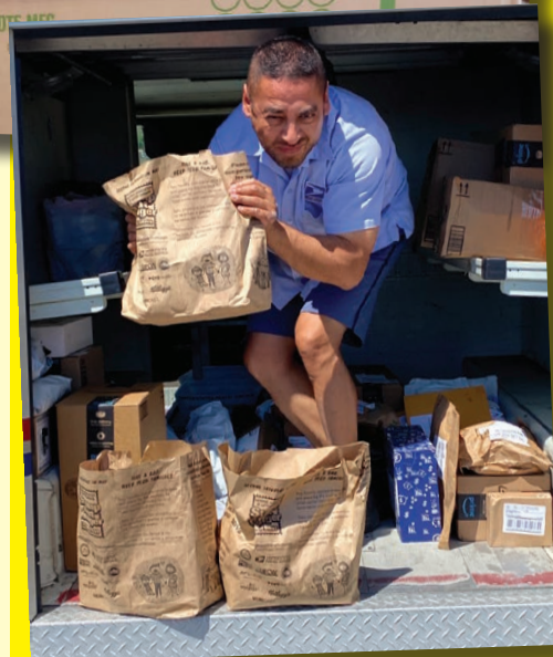
Top: St. Louis, MO Br. 343 Above: Bakersville, CA Br. 782

“In a county where one out of every four children is food insecure and with the school year ending soon, it was more