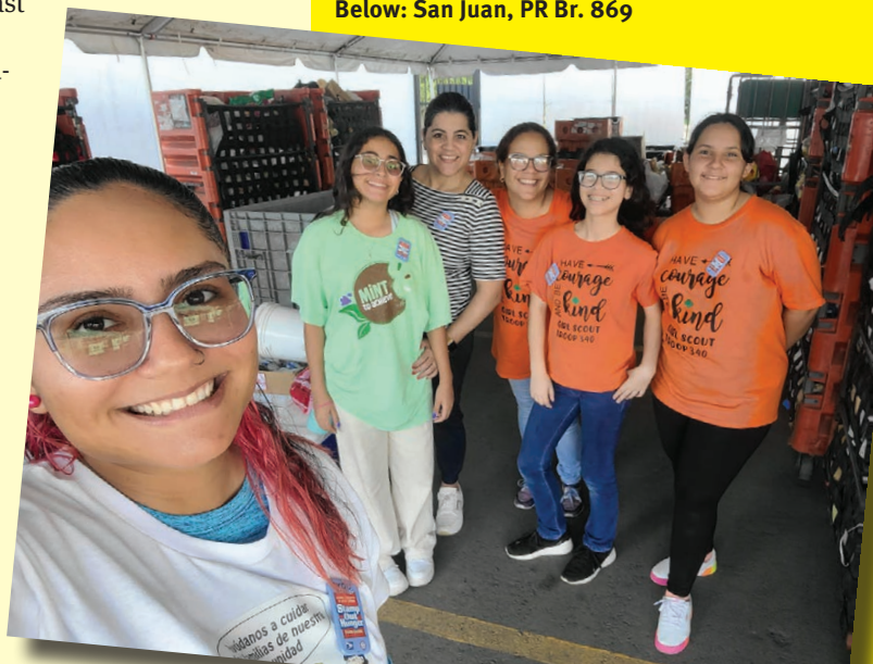
Below: San Juan, PR Br. 869