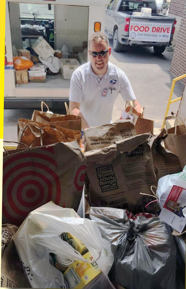
Above: Buffalo-Western New York Br. 3

The NALC is committed to the fight to end hunger within our communities and one way we work toward that is with our annual Letter Carrier Stamp Out Hunger food drive. NALC would like everyone to be mindful that while the food drive is held only one time per year, donations can be made year round via our virtual donor drive. Visit nalc.org/community-service/food-drive/2022-donor-drive for more information. PR