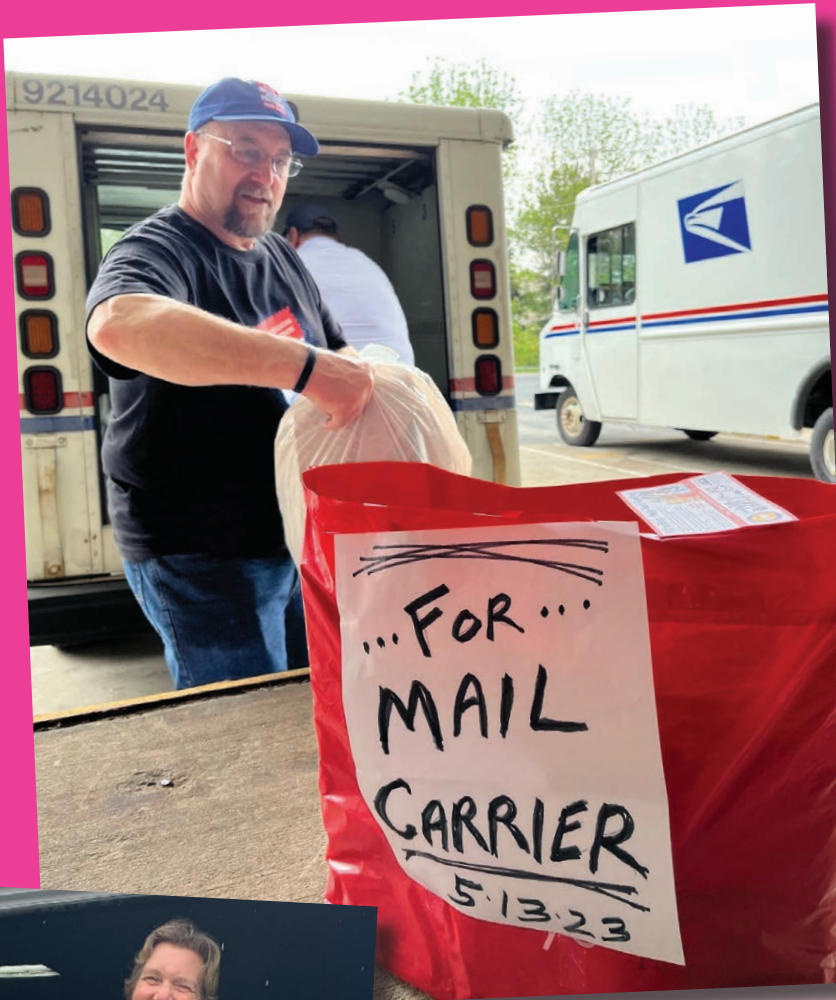
Below left: Rockville, MD Br. 3825

In addition, many branches continue to use the online donor drive developed to replace the in-person food drive during the pandemic. The donations received go directly to local food banks, enhancing their food-collection efforts.