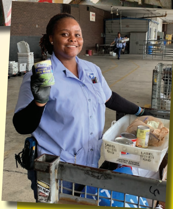
Above: New Jersey Mgd. Br. 38 Left: Pasadena, TX Br. 3867