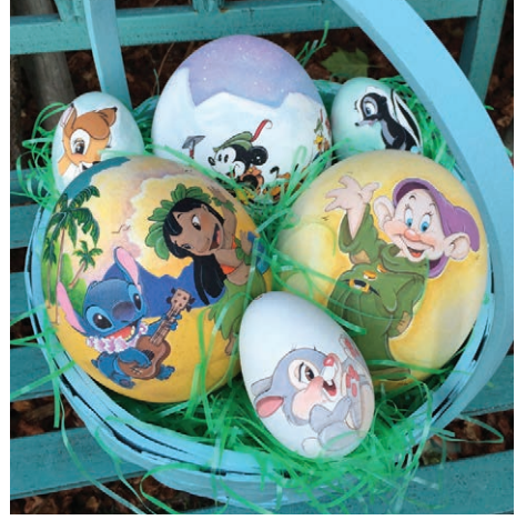
From I: Candy corn-themed gourds, a vinylmation of Ursula from "The Little Mermaid," as well as ostrich and other large Easter eggs. Below: One of his drawings on paper

Creating on gourds isn't the same as on paper. "Sometimes you've got to draw it on there differently just because of how the shape is, because it's not like a flat piece of paper. You've got to go with the movement of the gourd," he said.