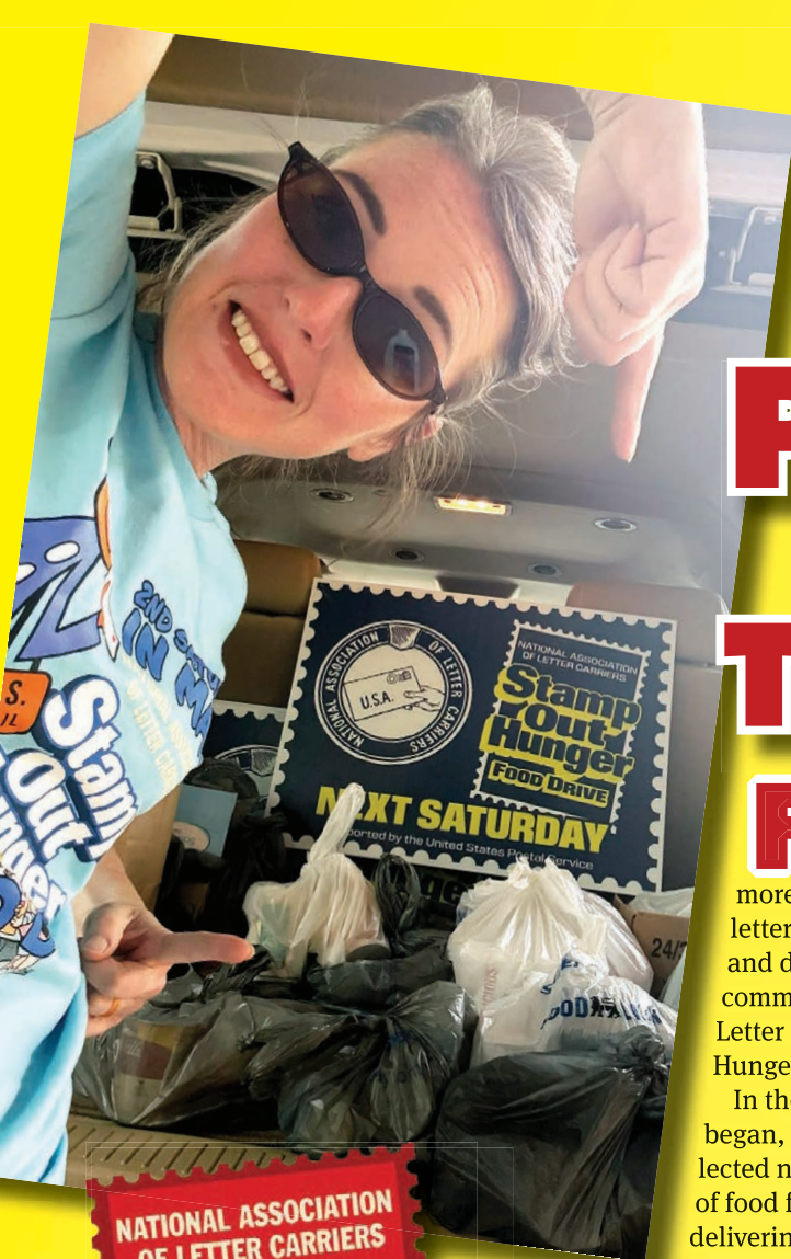
Asheboro, NC Branch 2560