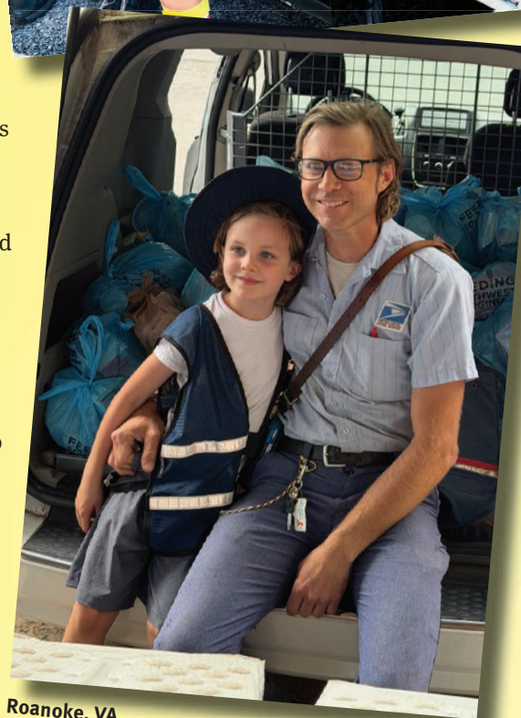
Roanoke, VA Branch 524

On the following pages is the list of branch totals received at NALC Headquarters by June 7.