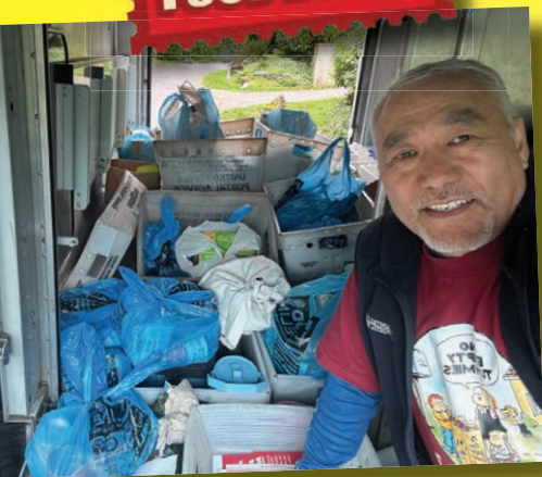
Seattle, WA Branch 79