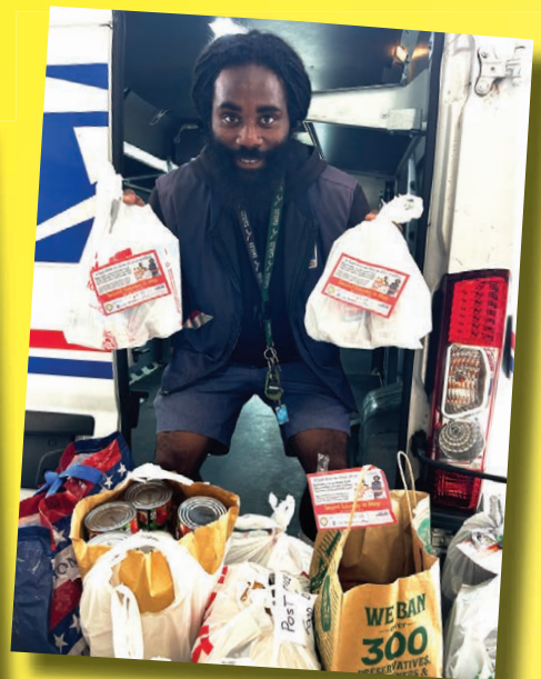
Southeast Pennsylvania Merged Branch 725

In media articles and on social media, food banks serving communities across the country reported the totals and expressed their gratitude: