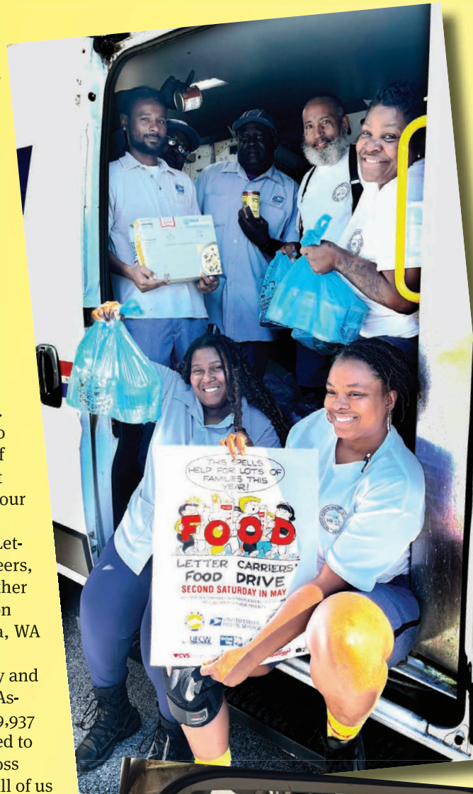
St. Louis, MO Branch 343

saas, Community Engagement Manager at Feeding South Dakota