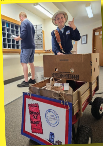
Kendallville, IN Branch 952

have much effect. And that's when I just said, 'Nothing else matters but the bags.'