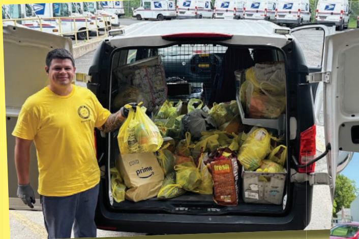
Left: Princeton, NJ Branch 268 Below: Peoria, IL Branch 31

the food drive. She is a scoutmaster with Scouting America and convinced her local scouting council to combine its food drive with the NALC effort.