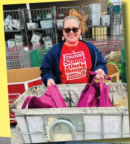
Van Nuys, CA Branch 2462