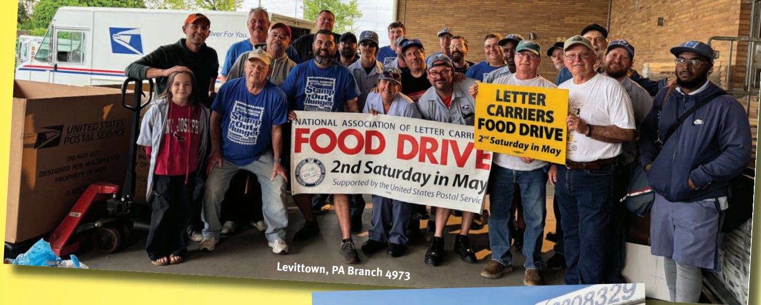
Levittown, PA Branch 4973

of food, which was more than the years before,” he said. “We were able to distribute that to six different food pantries here in Morgantown.”