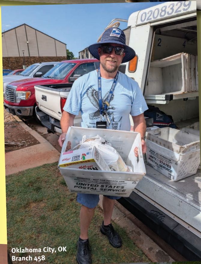
Oklahoma City, OK Branch 458

Branches were asked to report their food drive totals to Headquarters by June 7. The total pounds of food collected, and top branch collections, will be announced in the July issue of The Postal Record . PR