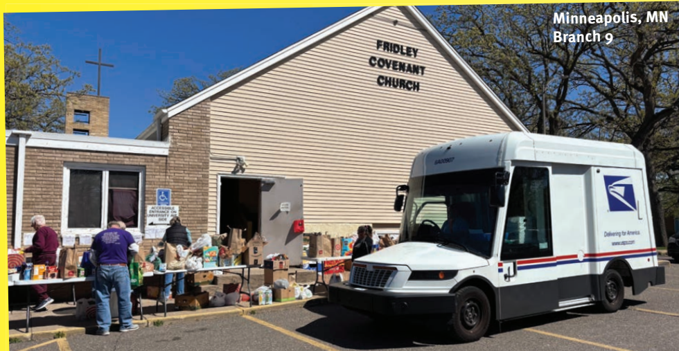
Minneapolis, MN Branch 9