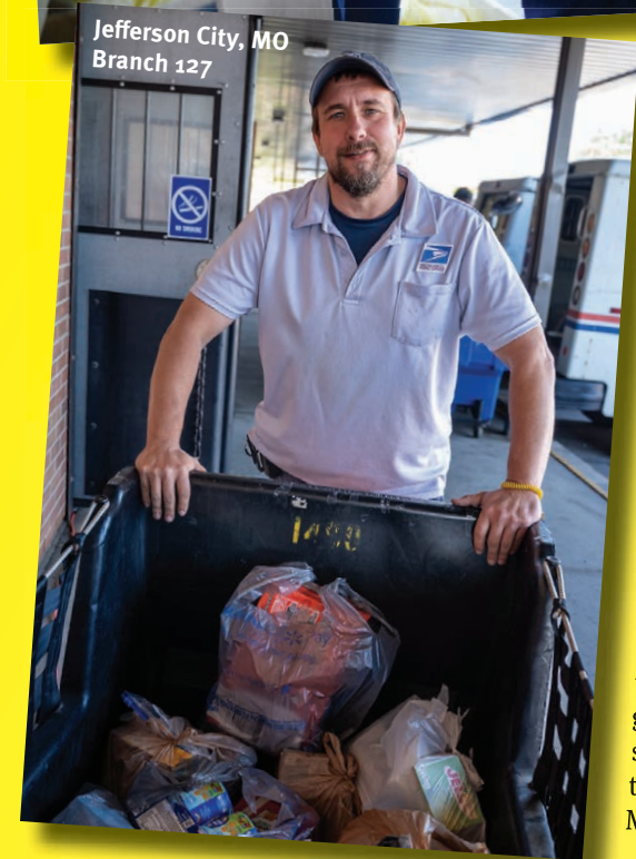
Jefferson City, MO Branch 127