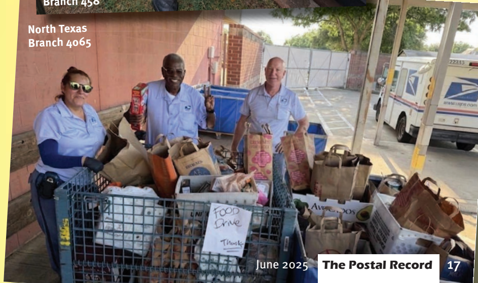
North Texas Branch 4065