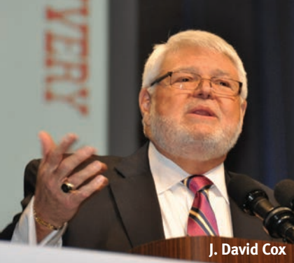
J. David Cox