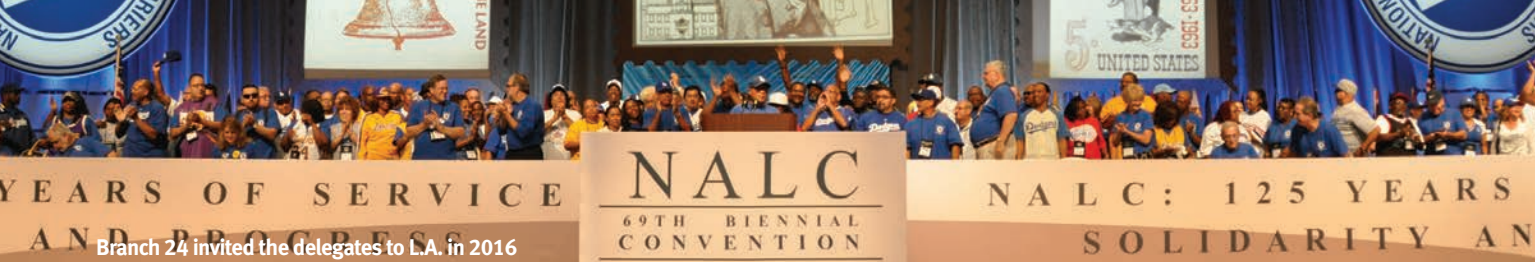
Branch 24 invited the delegates to L.A. in 2016

broadcast from 1952—the first installment of what became the annual MDA Telethon—that demonstrated the union’s early commitment to the cause.