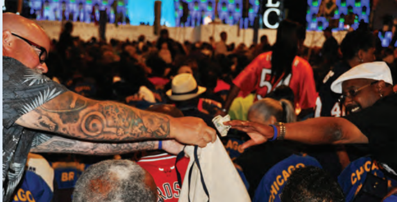
A delegate (r) stretches to donate money to a teller, as the attendees collected funds for stricken carriers and a clerk whose son died in Aurora, CO.