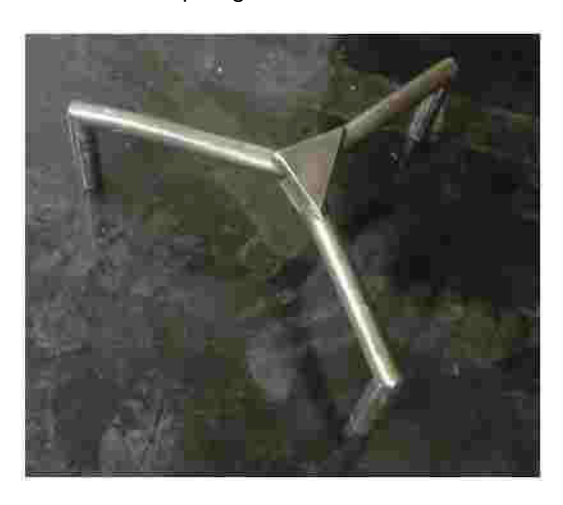
Exhibit 6 Integrated Tow Bar

The three-pronged coupler is for general use to connect a PIT to a wheeled equipment or to connect wheeled equipment to wheeled equipment for towing. The three-pronged coupler does not fit the BMC-OTR container because of the fixed distance between the prongs.