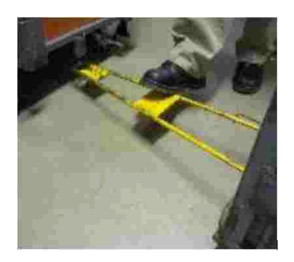
Exhibit 7 Swivel Tow Bar

The swivel tow bar is for general use to connect a PIV to wheeled equipment, or to connect wheeled equipment to wheeled equipment for towing. The swivel tow bar has longer prongs than folding tow bar.