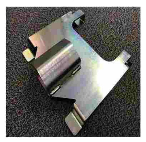
Exhibit 8 Snap-On Tow Pocket – Rigid Wire Container